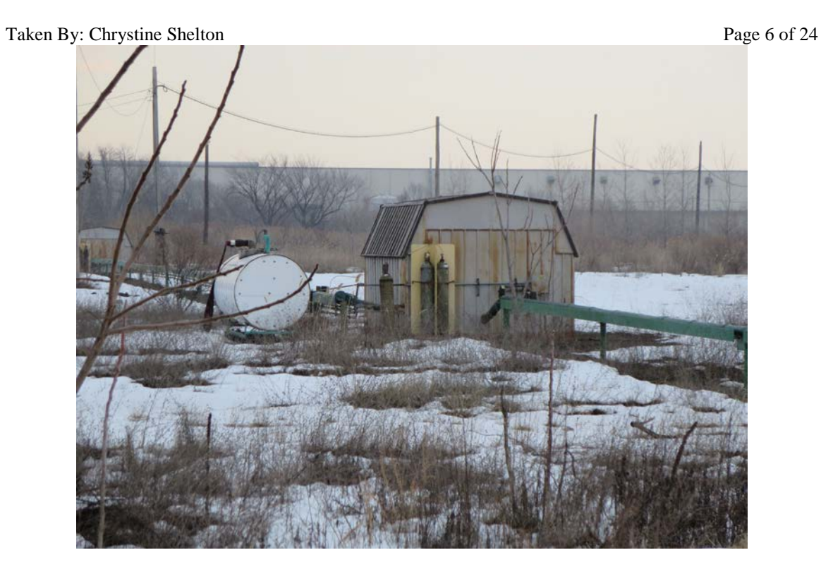
Photo 11: View of the former Rod and Wire Mill pump and treat system.