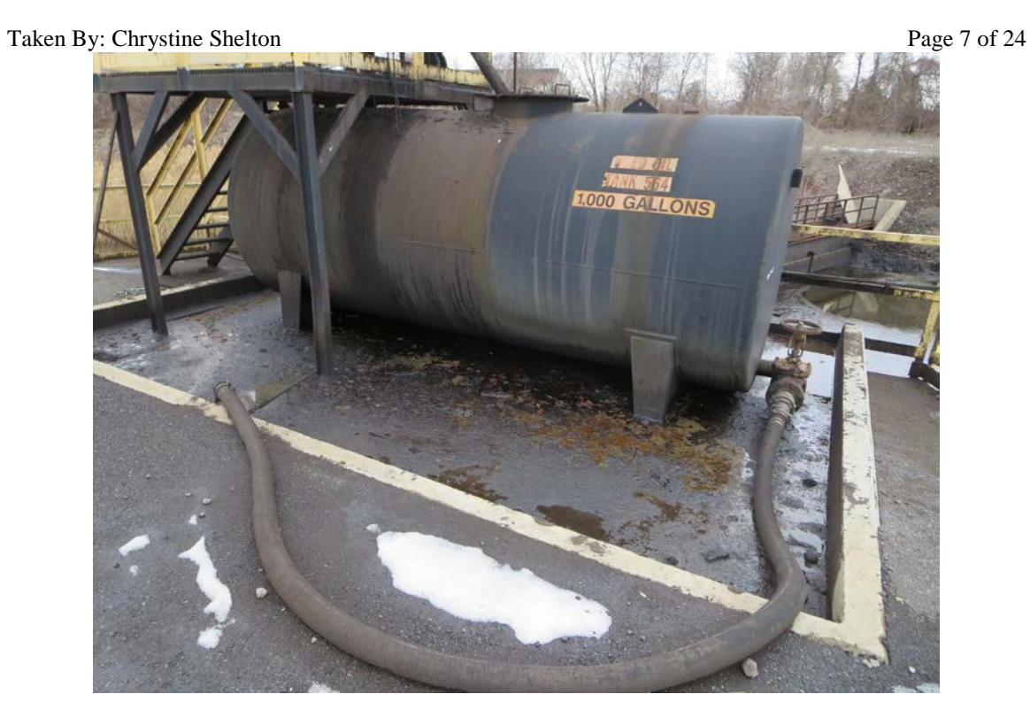
Photo 13: View of used oil AST and leaking into the Tin Mill Canal.