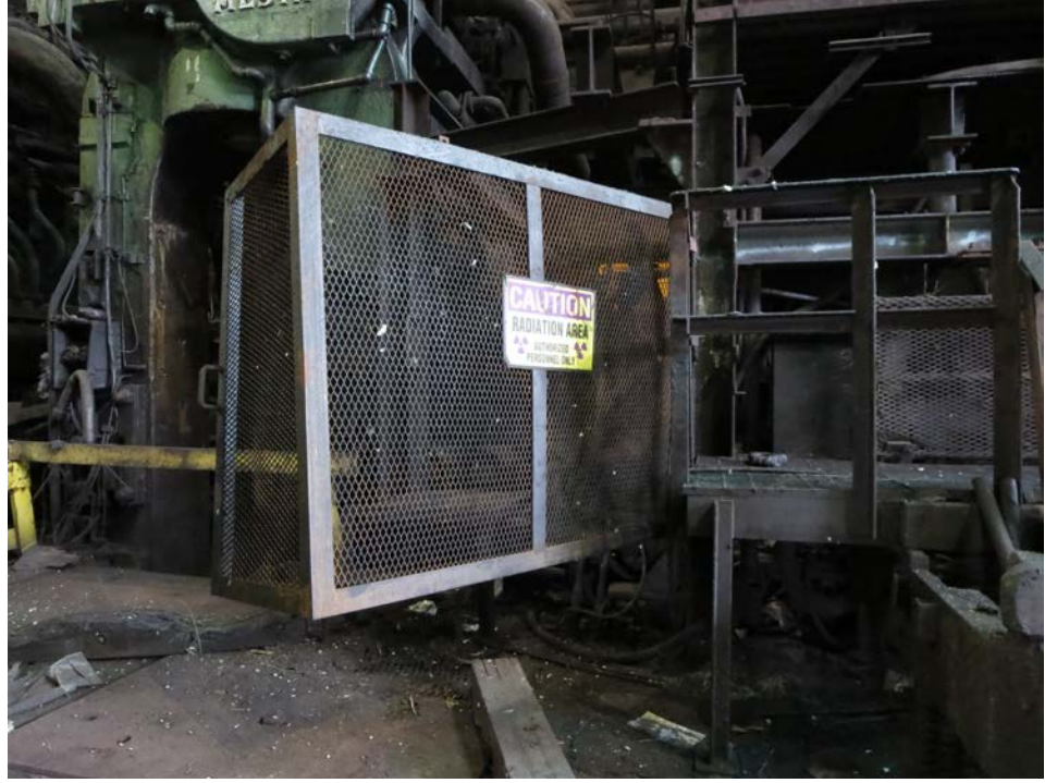
Photo 19: View of former radioactive materials area in the Hot Strip Mill.